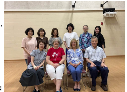
Coffee and Conversation builds community and allows participants to practice English conversation.

This is by no means a complete list, but it is a reminder that much of our work is the day to day tasks that make the rest possible. The pictures to the side represent just a few opportunities that taking care of the "practical stuff" makes possible.