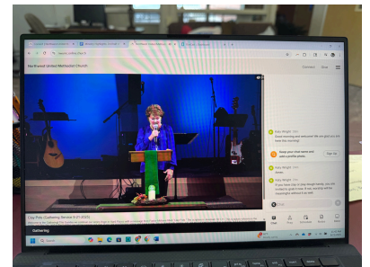
Online Worship continues to be an important connection with people who can't make it to the building.